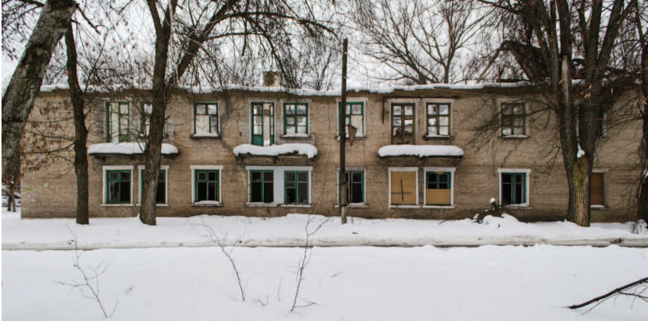
Fig. 2: A dilapidated apartment building, whose residents were relocated according to the housing program. Photo: M. Bolotov, 2020

After the USSR collapsed when economic and population decline became the main trends in Novoshakhtinsk, the city's fragmentation increased due to the degradation of the never complete settlements' peripheries and vacancies or abandonment that spread all over the city. The successful attraction of the state investments and implementation of the new housing projects, on the one hand, improved people's living conditions but, on the other hand, accelerated erosion of urban morphology due to the relocation of the residents into the new residential areas.