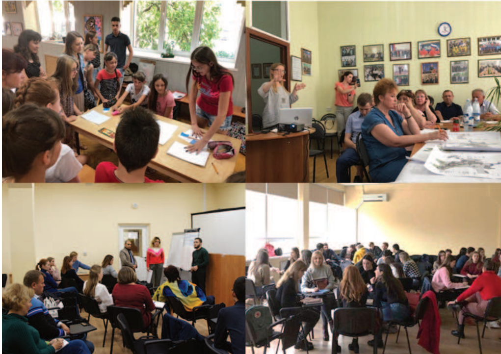
Fig. 3: A series of participatory workshops organised for different groups: children, students and representatives of the municipality.

decline exist and all of them have been implementing in totally different conditions compared to Novoshakhtinsk. For example, the famous policy of the ‘controlled shrinkage’ that the Arctic city Vorkuta implements has been realizing in the conditions when the bigger share of housing is presented by the apartment residential buildings and is owned by the municipality (POLYAKOV, 2019). In Novoshakhtinsk applying similar tools is impossible due to the high share of private property and single-family houses with a garden as the prevalent typology: such conditions conduce emerging of numerous erosions in different parts of the city that hardly can be controlled.