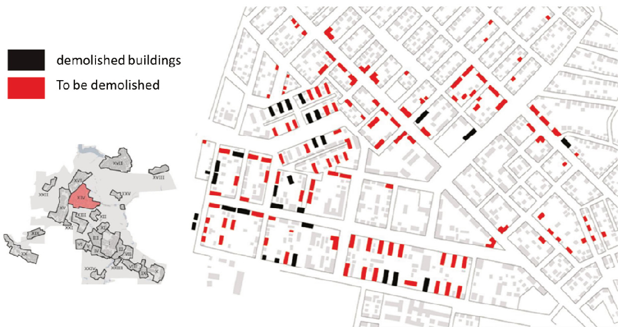
Fig. 4: A fragment of the Zapadny settlement' territory with the mapped demolished and planned for demolishing buildings. The map was developed on the basis of the municipal monitoring register with the following actualisation through the field trips observations.

During this long process the main principles for a master-plan were developed, which are defined as the most important for its successful implementation: 1) True assessment – impartial evaluation of available resources and existing issues; 2) Continuous harmonized planning; 3) Realism and efficiency – setting achievable goals and identifying resources, careful and efficient use of available resources and the generation of new resources; and 4) Involvement.