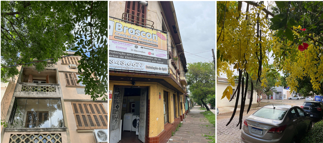
Fig. 3,4 and 5: Some dynamics existing in the Fourth District nowadays – this is REAL.

Coexisting in harmony with Nature is key.