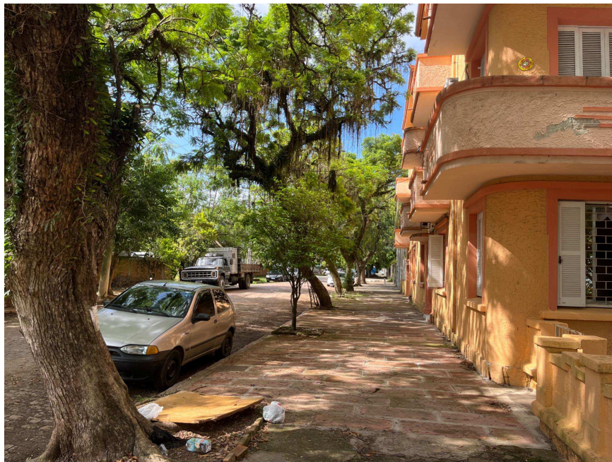
Fig. 2: Example of a street atmosphere in the Fourth District today - the desired future may have already existed.

Some of these buildings still stand resilient (see fig. 2), as a piece of resistance, despite facing challenges from social, economic, and environmental pressures, as well as the influence of the starting real estate production. When prompted to "keep planning for the real world," especially in revitalizing old areas to meet contemporary needs, it seems prudent to carefully consider what these needs entail. It's possible that the solution for them has already existed, and we merely need to adapt them to our current circumstances. In truth, genuine progress reminds us that our fundamental human needs remain relatively unchanged over time. However, we often overlook them, distracted by the multitude of tasks and information that bombard us daily.